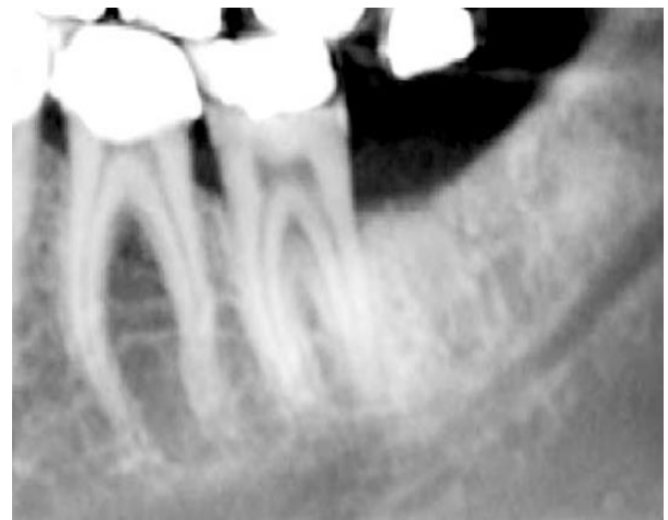
After extraction and grafting