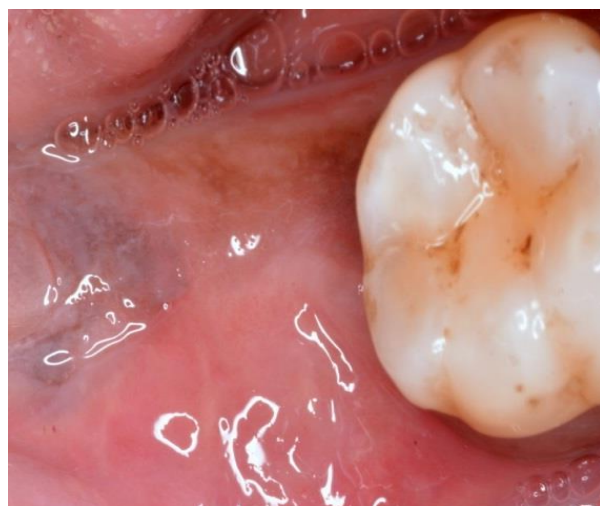
2 weeks after grafting